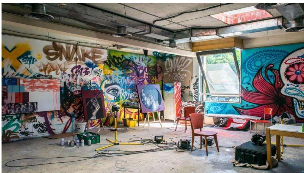
Fig. 1. Interior space of a warehouse converted into art-residence

Today, the experts have deduced the concept of art residence, its dynamic development, and its changing nature, which encompasses a wide spectrum of activity and involvement. New technologies offer new experiences including residencies in the digital space. The essence of the concept of the residential space, the residencies of artists, which offer plastic artists and other creative professionals time, space, and resources to work, individually or collectively, in the fields of their practice, figure 1 [8].