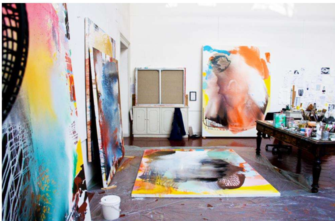
Fig. 4. Spațiu interior a art-reședinței cu forme combinate

Therefore, for the interior of the art-residences you will opt for light, neutral colors that do not create visual discrepancies and focus the artist on the creative activity, figure 4. So, we distinguish two ways from the divided finishes based on going through the art-residence typology: