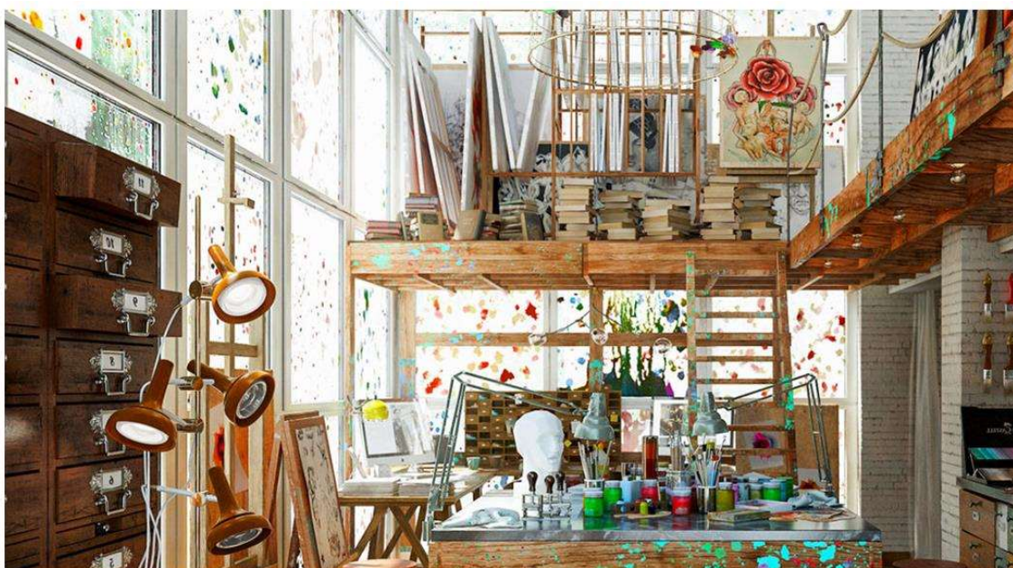
Fig. 3. Interior space of the art-residence with combined shapes

As a result of the analysis of the psychology of human expression within the built architectural space, of the aesthetics of the active area space of the art-residences, of the workshops it is recommended to be solved in an open-space type with the easy possibility of transforming these with mobile walls according to the requirements of the artist. Open-space offers the artist the normative, functional space necessary for a free and chaotic, creative arrangement of the machines, work instruments as well as the necessary reverie space. Also, within the exhibition spaces it is recommended to bunk them [14].