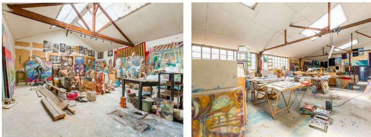
Fig. 2. Art-residence with opening to nature – windows, skylights

the creative process. Thus, the sensory dialogue between the user-artist and the space of contemplation-nature is achieved [10].